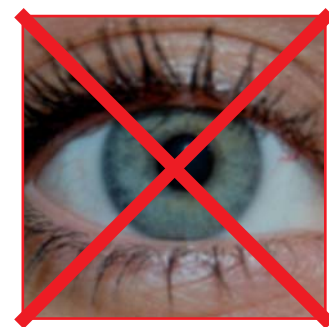
low lid, too blurry