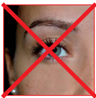
too far away